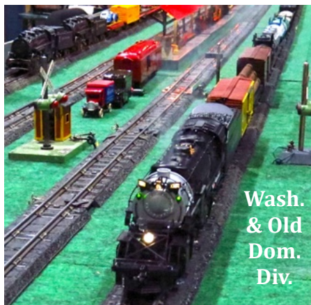
Wash. & Old Dom. Div.