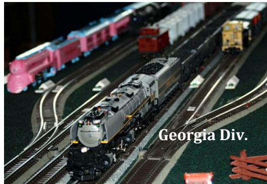
Original American Flyer by A. C. Gilbert