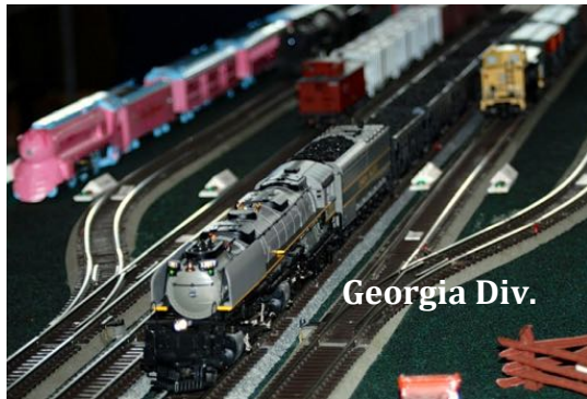
Original American Flyer by A. C. Gilbert